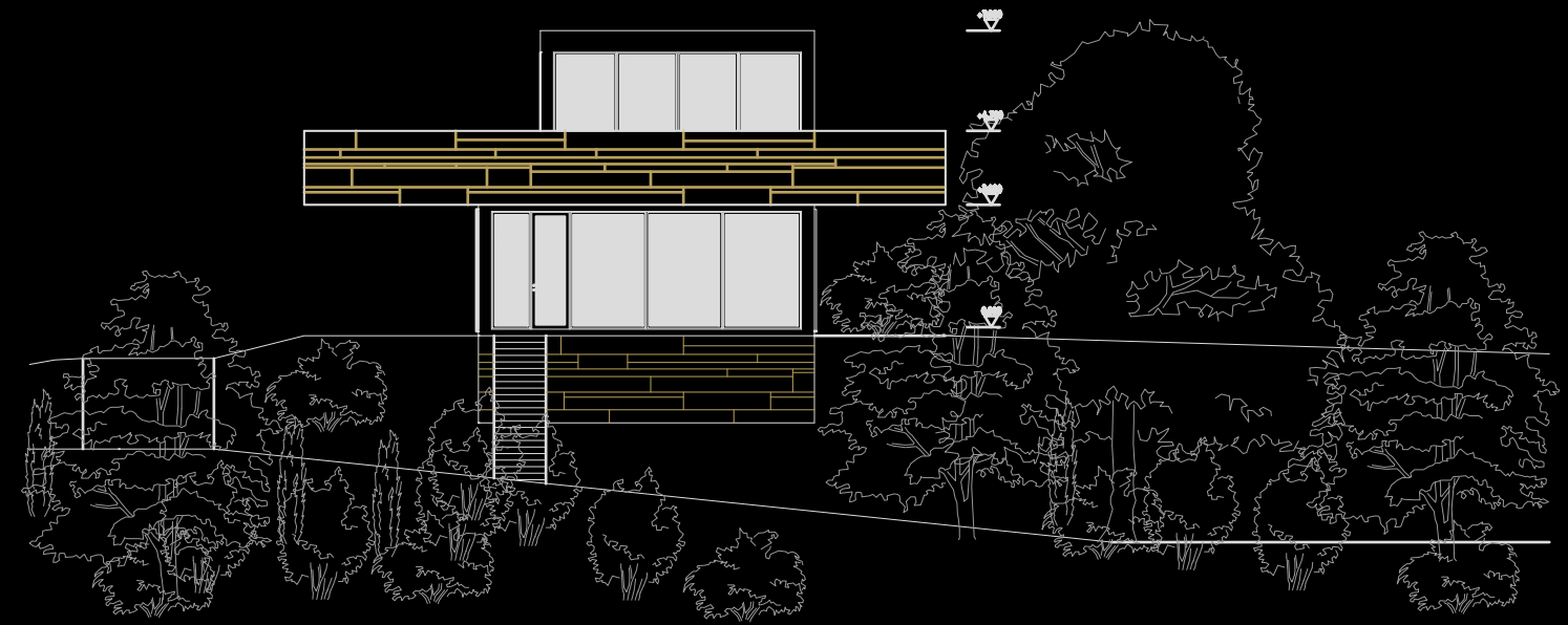
FASADAS 2 ELEVATION 2